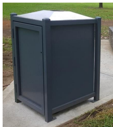
EM206 in Ironstone Satin powder coat