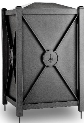
EM206-COS with decorative circle-star & City of Sydney logo option (custom logos available)